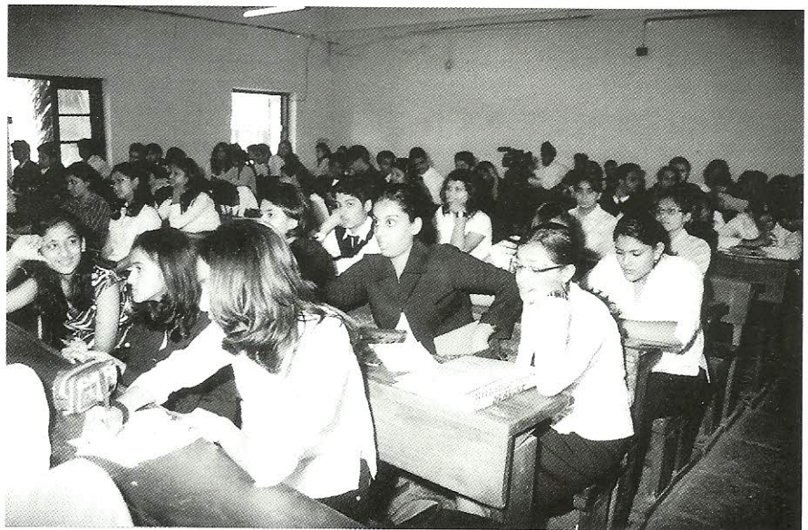
Student Delegates (Participants) from various colleges of Mumbai

Nations was entirely organized by the college youth. This Model United Nations got huge response from different colleges and schools of Mumbai within short span of time. The young student on the secretariat had taken care of food, conference, venue, discipline and other arrangements including the budget