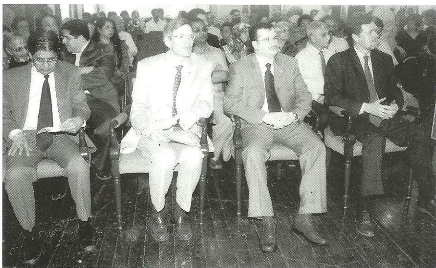
UN Day 2007 held at Raj Bhavan on 3rd November 2007 at Mumbai Photo of Audience

and is creating awareness among people about the broader objective of UN.