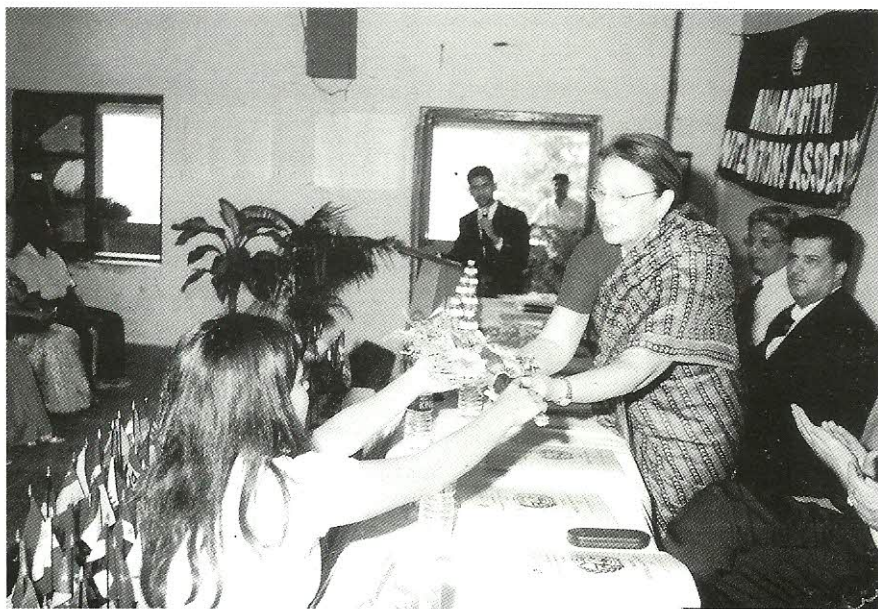
Human Rights Day Observance